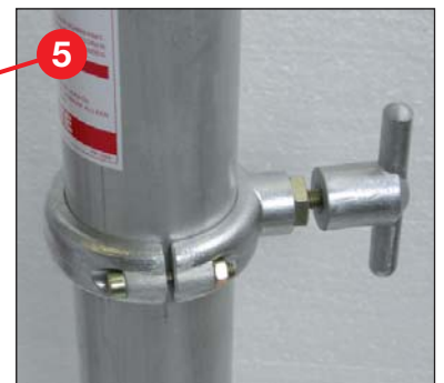
Clamp handle for quick and easy fitting onto a tripod or vehicle mounting bracket