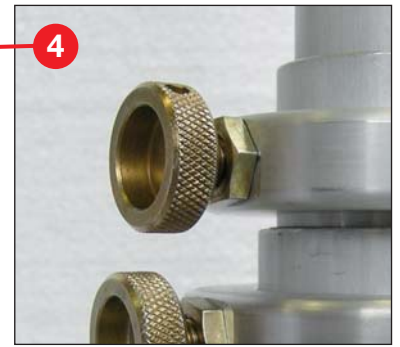
Clamp collars to adjust the height of the non-keyed mast sections