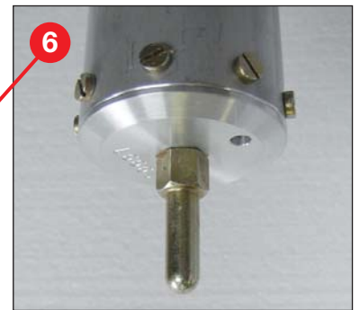
Bottom pin for quick and easy fitting onto a tripod or vehicle mounting bracket