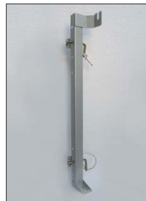
Vehicle Mounting Bracket Set