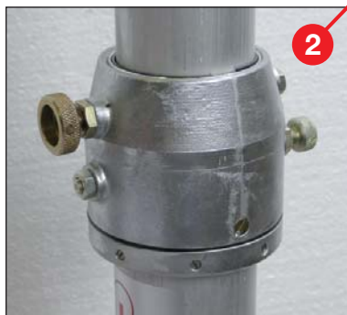
Lockable rotating collar