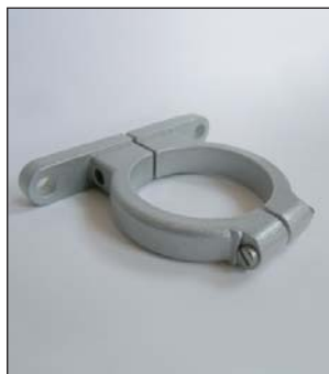
Wall Mounting Bracket