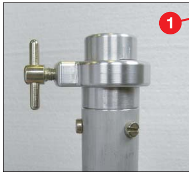
24 mm diameter quick clamp socket