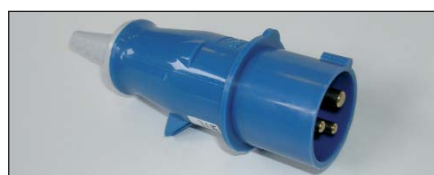
Type CEE17 Colour : blue Cat. No. B11861

Plugs recommended for 230 volt installation