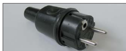
Schuko type with extra earth pin connection and rubber body Cat. No. B11619